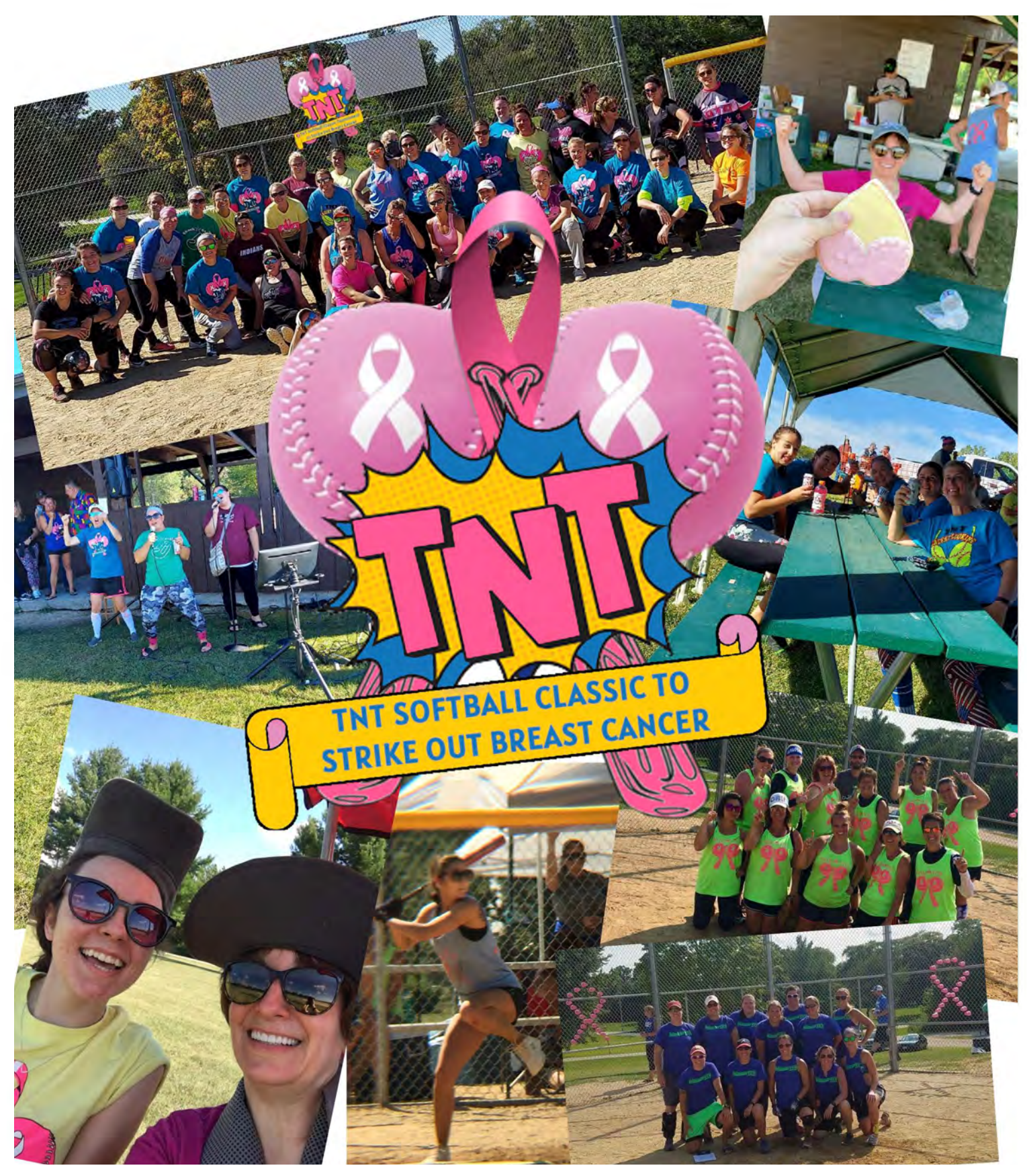
TNT SOFTBALL CLASSIC TO STRIKE OUT BREAST CANCER